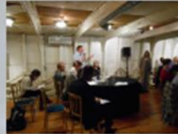
Tall Ship Glasgow June 2013