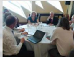
ISMF Workshop, Titanic Belfast June 2012